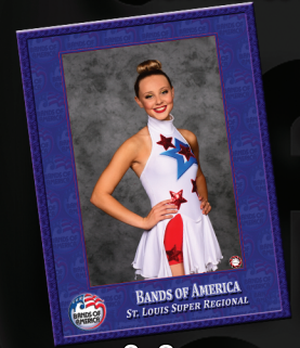
6x8 GRAPHIC PORTRAIT

PORTRAITS ARE TAKEN AND WILL BE AVAILABLE FOR ON-SITE PURCHASE AT ALL SUPER-REGIONALS. ACTION PHOTOS ARE TAKEN AT EVERY REGIONAL AND SUPER-REGIONAL ANE ARE AVAILABLE ON-LINE.